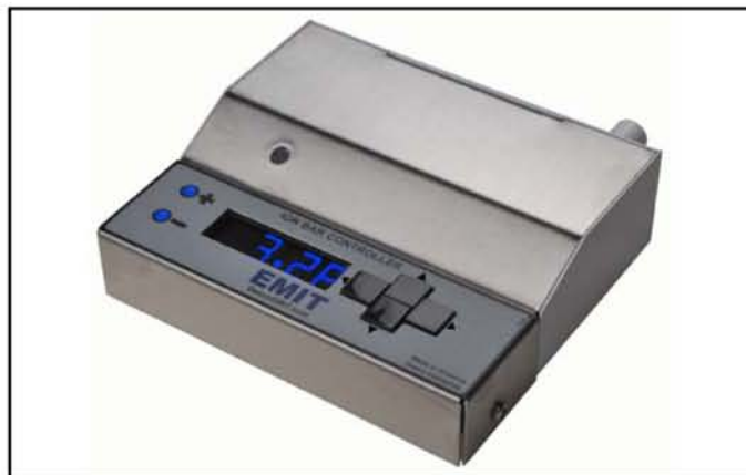
Figure 5. EMIT 50855 Controller with Digital Adjustment