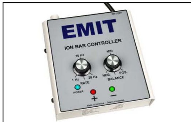
Figure 4. EMIT 50945 Controller with External Potentiometer Adjustment