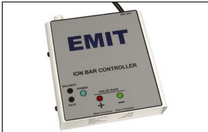
Figure 3. EMIT 50940 Controller with Recessed Potentiometer Adjustment